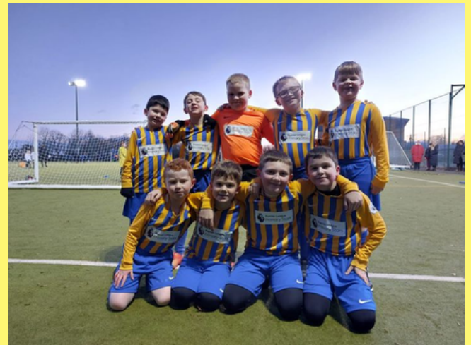
CSET Football Festival