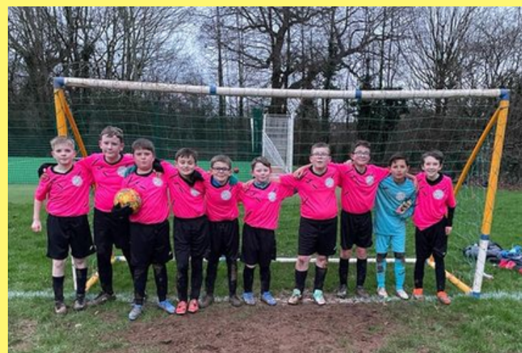
Barrs Court Titans 4-2 Park Dynamos