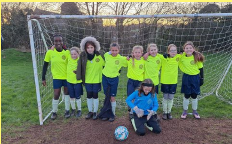
CSET Year 2/3 Multi-Sports Festival